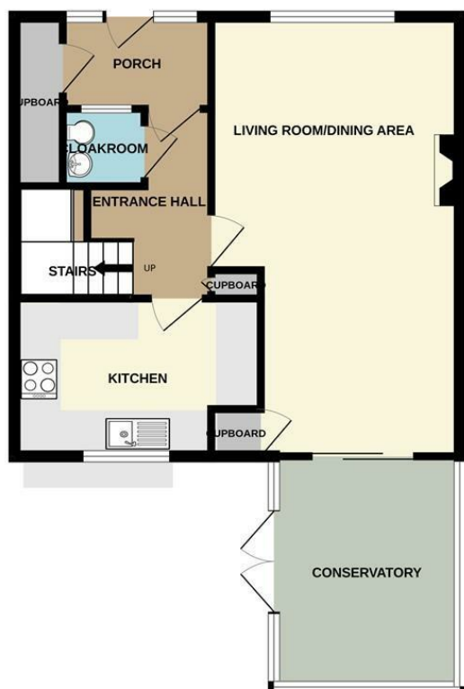
GROUND FLOOR 570 sq.ft. (52.9 sq.m.) approx.